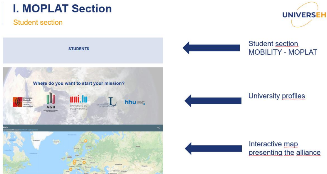
Slide 2. Student section.

As outlined in D2.5, MOPLAT is designed for students, researchers and staff. Accordingly, these define the targeted audiences to which information is provided, as can be seen in slide 2 and 3 below. Regarding the infrastructure of the MOPLAT section, the underlying web design concept follows the same structural principles of a scroll-down presenting first the headline of the section, followed by the different university profiles allowing to choose the user where to start his/her mission. Finally, the integrated interactive map presents the alliances' locations and allows the user to geo-locate UNIVERSEH him/herself whilst simultaneously displaying the entire alliance at once.