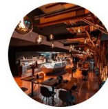
La rue de Demain