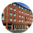
Ibis Namur Centre