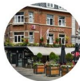
Le Clou Doré