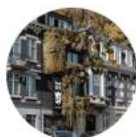
The Royal Snail